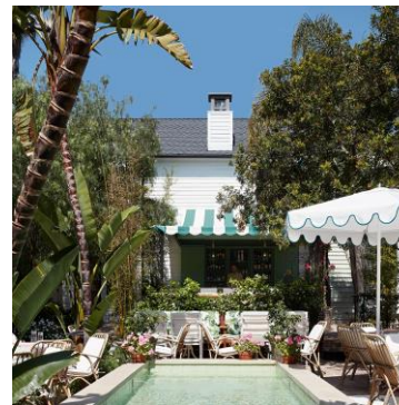
San Vicente Bungalows West Hollywood, CA