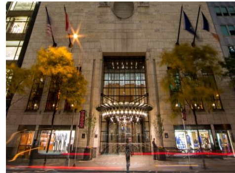
Four Seasons Hotel New York, NY