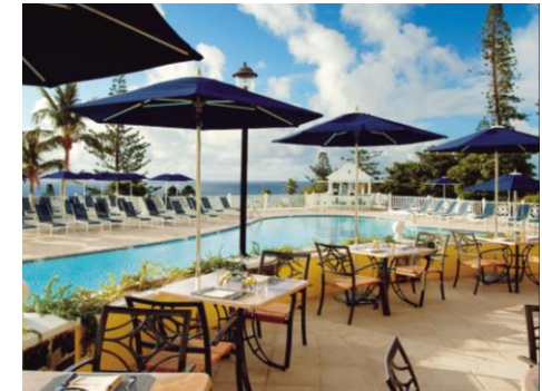
Elbow Beach Resort Paget Parish, Bermuda

For a full list of featured projects, click HERE .