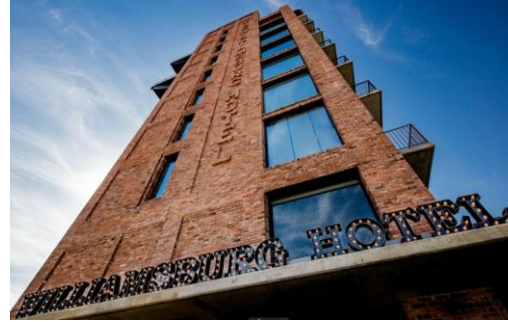
The Williamsburg Hotel Brooklyn, NY