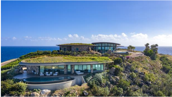
Oil Nut Bay Virgin Gorda, BVI