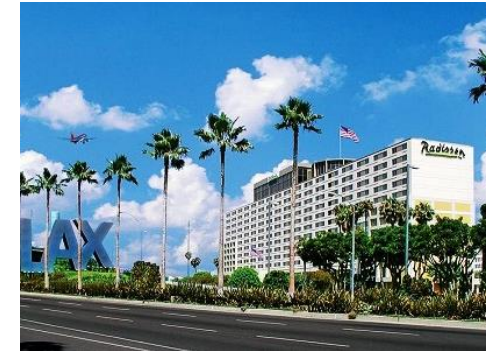
Radisson Hotel LAX Los Angeles, CA