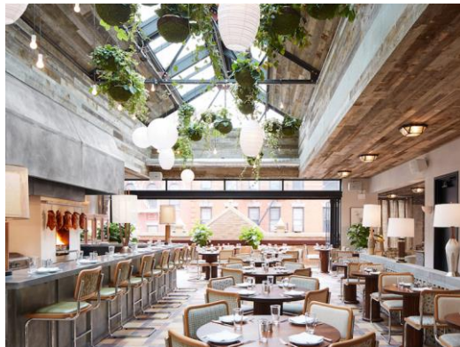
Ludlow House New York, NY