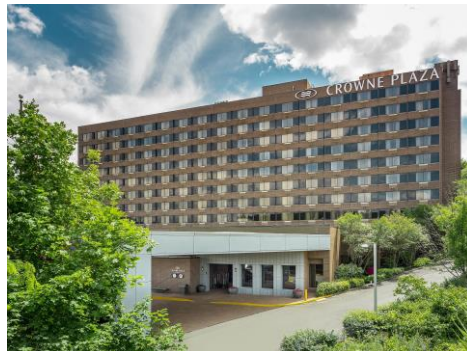
Crowne Plaza Hotel Danbury, CT