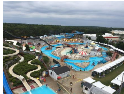
Water Wizz Waterpark East Wareham, CT