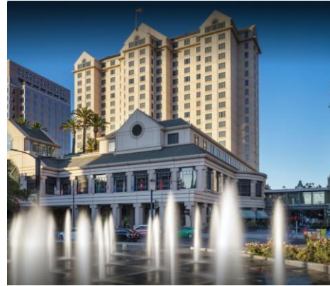
Fairmont San Jose San Jose, CA