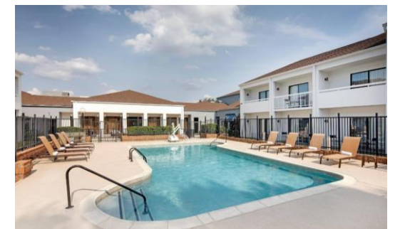
Courtyard by Marriott Dallas Addison Addison, TX