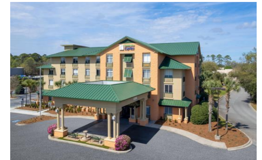
Holiday Inn Express & Suites Bluffton Bluffton, SC

For a full list of featured projects, click HERE .