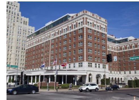
Chase Park Plaza Hotel St Louis, MO

For a full list of featured projects, click HERE .