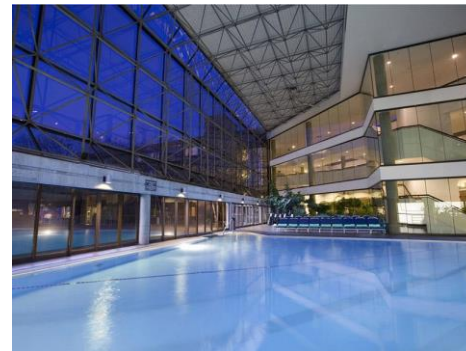
Doral Arrowwood Rye Brook, NY