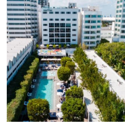
Nautilus by Arlo Miami Beach, FL