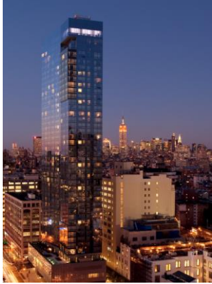
The Dominick New York, NY