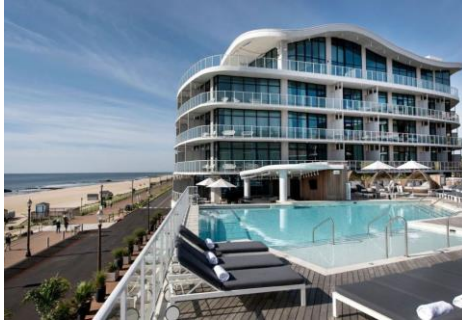
Wave Resort Long Branch, NJ